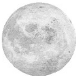
The 3D Printed 'Moon'